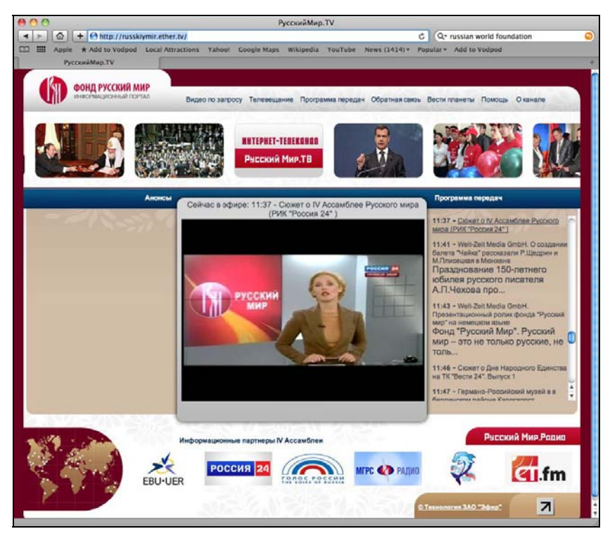
Figure 4. Internet television station 'Russkii mir.tv'.