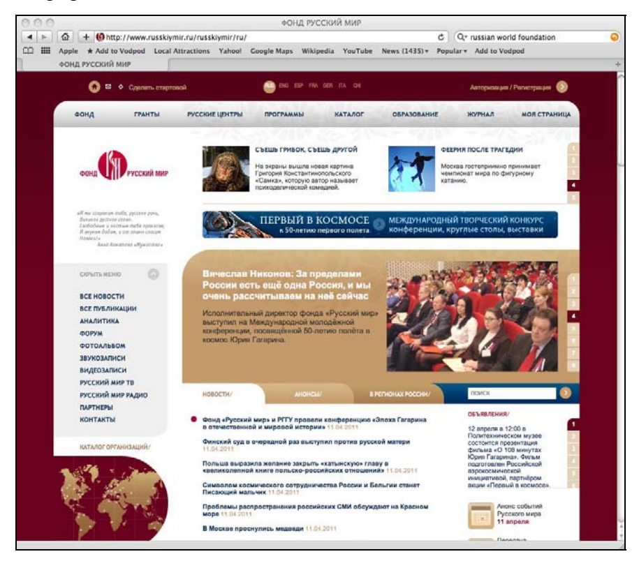
Figure 1. Homepage of the Russian World Foundation.