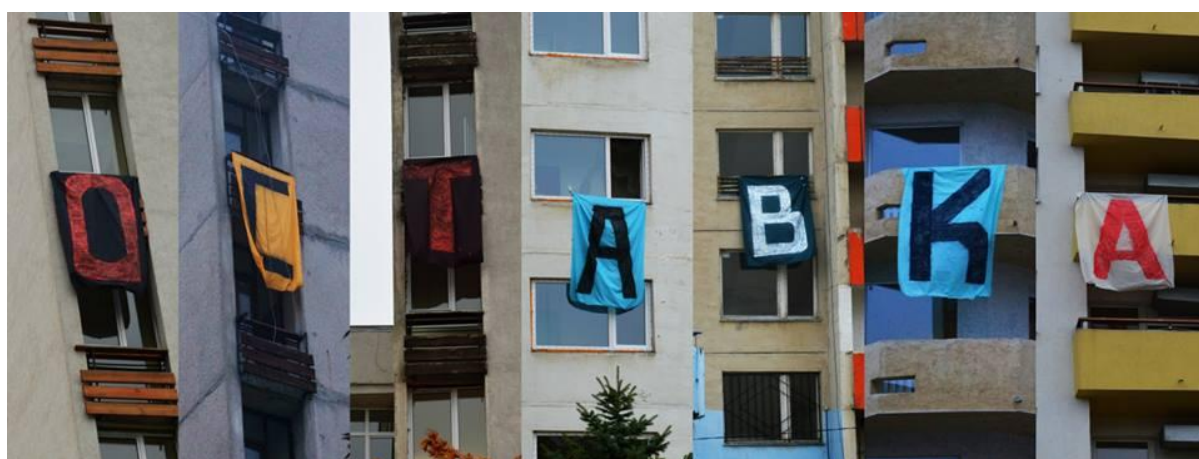
Image 3: The action ‘ Ostavka ’ [‘Resignation’] in Studentski Grad.