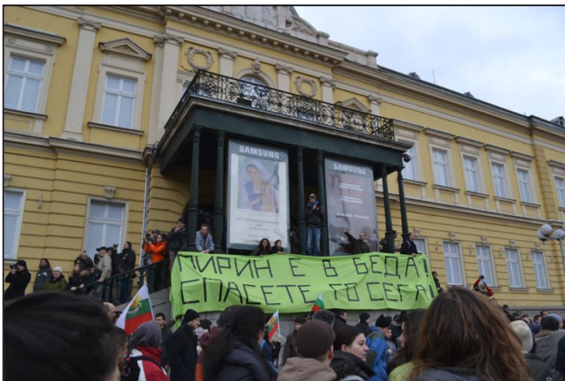
Image 1: The banner with the slogan ‘Pirin is in trouble, save it now!’ held by the green activists during the demonstration on 24 February 2013.

During the same period, a parallel series of protests starting earlier in January 2013 (or already in late December 2012) defended another cause: the protection of natural reserves in Pirin and the seaside. The environmental cause was championed especially in Sofia, with significantly fewer participants. The actions took place every Tuesday and Thursday during January and February, provoked by a particular government act allowing for more development and construction of ski facilities in the mountain of Pirin.