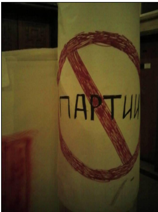
Image 4: ‘No parties’, a banner in the occupied building of the Sofia University