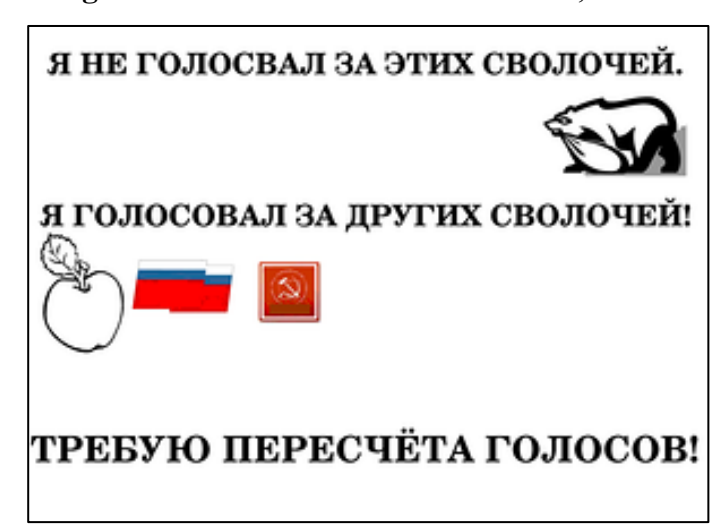
Image 2 . "I did not vote for these bastards, I voted for the other bastards'.