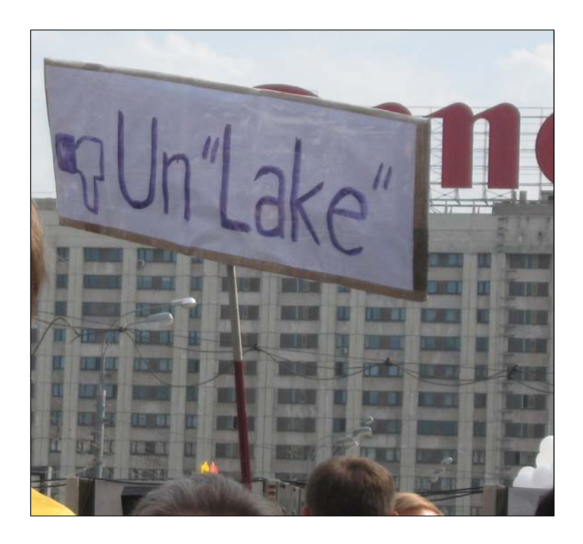
Image 6 . "Lake" is a reference to the dacha cooperative "Ozero" outside Leningrad in the 1990s, whose members included Vladimir Putin and many of those close to him who are now in positions of power. Moscow, 6 May 2012.