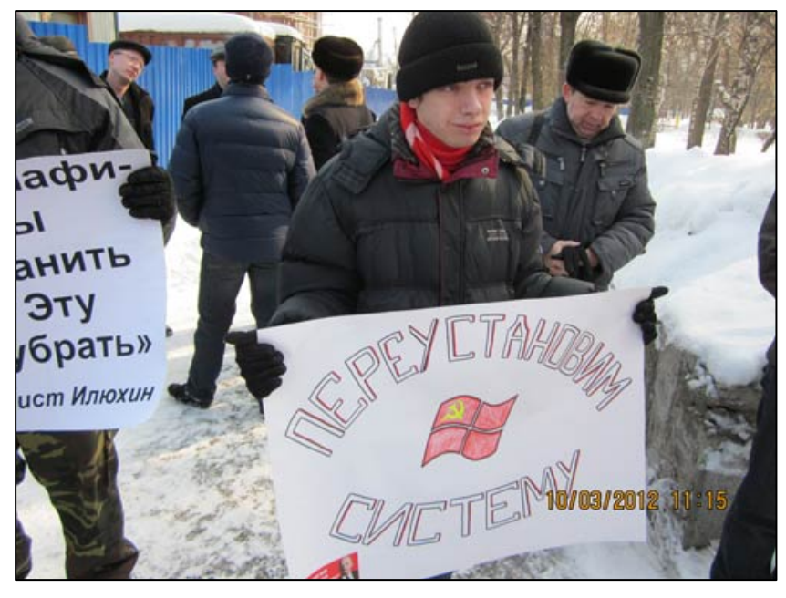
Image 7. 'Let us reinstall the system'. Penza, 10 March 2012.