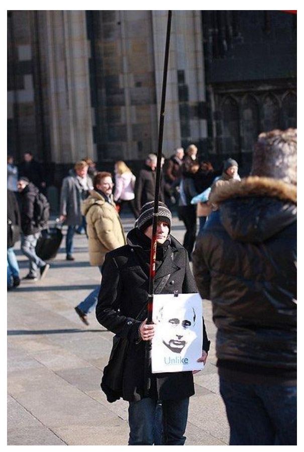
Image 1 . 'Unlike'. Cologne, 4 February, 2012.