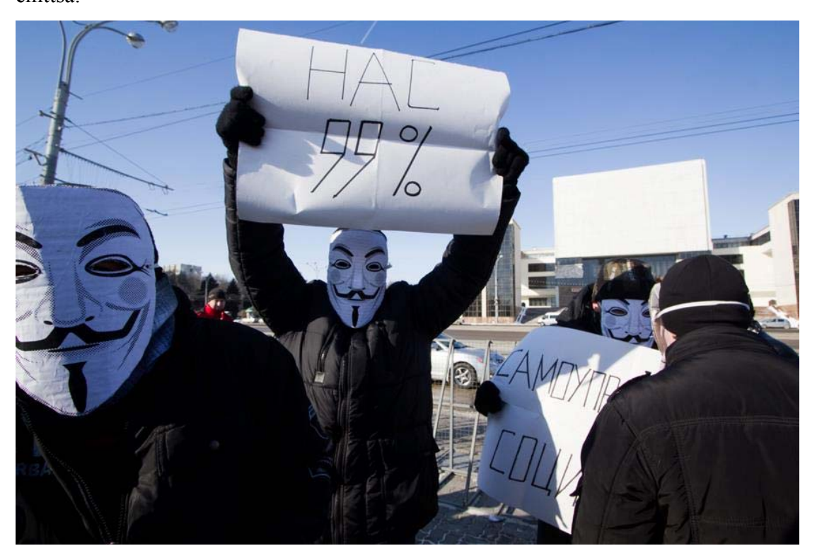
Image 8 . 'We are the 99%'. Rostov-on-Don, 4 February 2012.