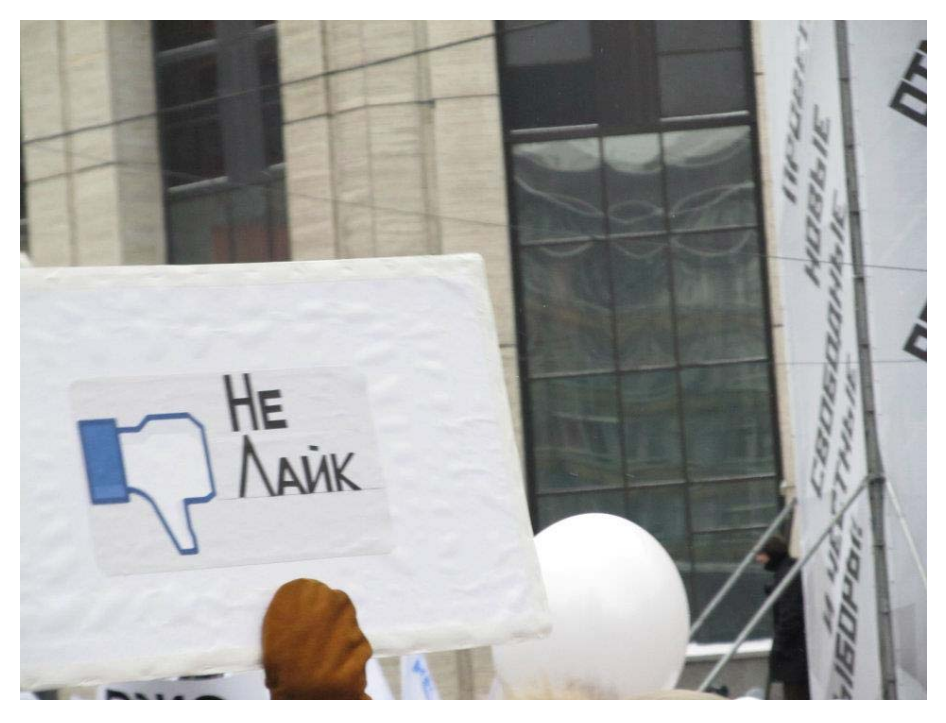
Image 4. 'Not like'. Moscow, 24 December 2011. Photographer Viktoriia Koroleva.

Source: https://www.facebook.com/photo.php?fbid=158935170877349&set=a.15893107754442 (accessed 28 May 2012)