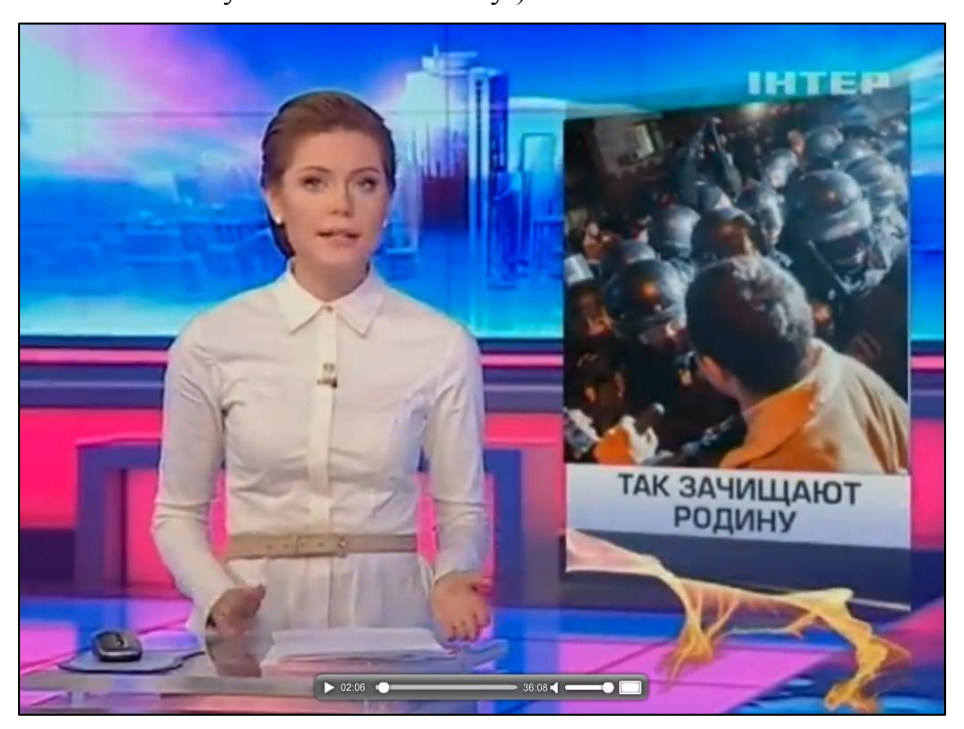
Image 3. A screenshot from the 20:00 Podrobnosti news bulletin on Inter , which showed the violence of Berkut riot police against protesters in a negative light (the photo is captioned 'That's how they defend their country')